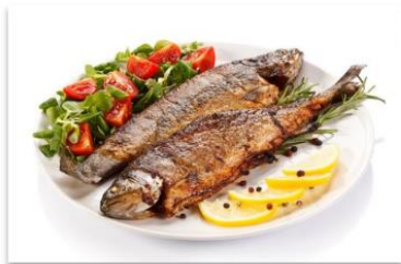
Fish from Carinthia